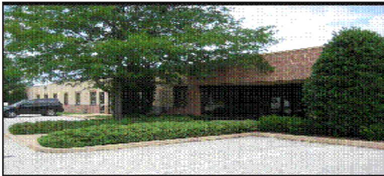
917 Old Fern Hill Road