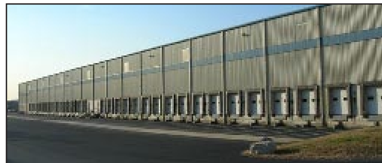
Packaging Corporation of America